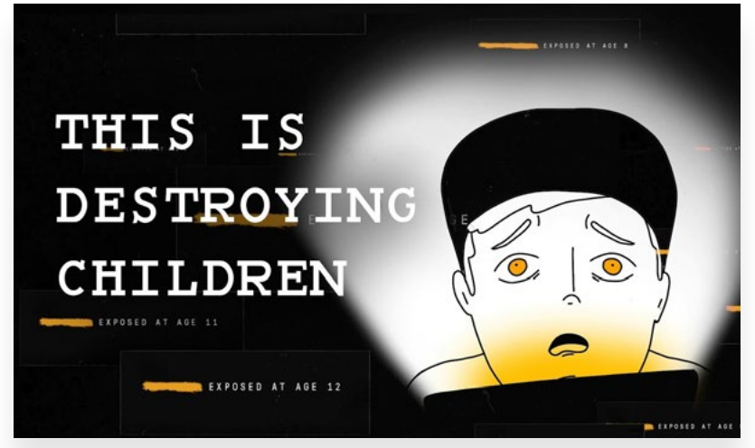
Sreenshot from "Millions of Children Are Watching Porn"